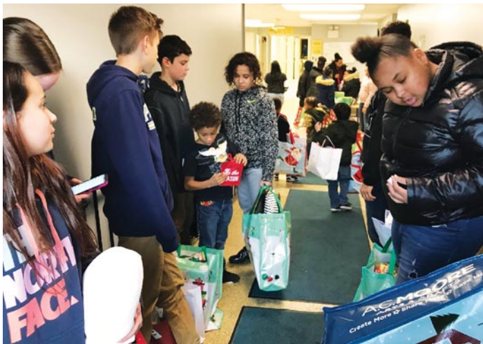
Kids at Christmas "Shop" in 2020

All items should be new or very gently used and clean. They may be brought to LUMINA's office at Otterbein UMC, 20 East Clay Street, Lancaster, on Saturday December 4, from 11 am until 1 pm.