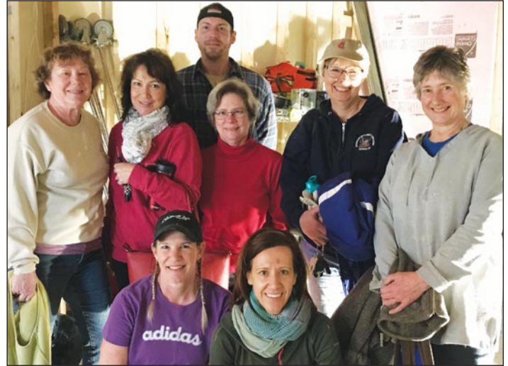
Manifest Women's Work Crew

If hammering and sawing aren't your thing, consid-