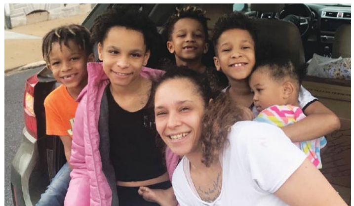
Jizzelly's whole family loved their weekend get-away camping experience