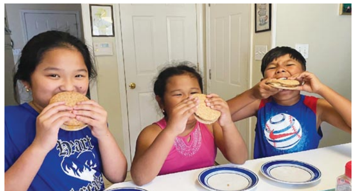
A Nepali family enjoys tuna burgers from a Super Cupboard zoom class.

Earlier this year we held Super Cupboard classes for families speaking Spanish , and this fall our classes were for Nepali speaking families.