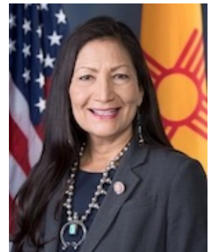
US Rep. Debra Haaland