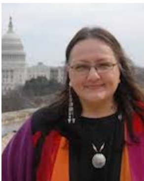
Suzan Harjo Native Rights Advocate