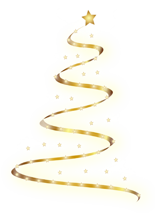
"When they saw the star, they rejoiced exceedingly with great joy." -- Matthew 2:10