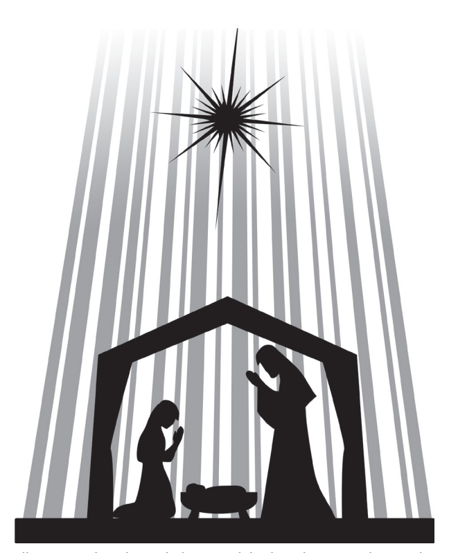
"For God so loved the world, that he gave his only Son, that whoever believes in him should not perish but have eternal life." --John 3:16