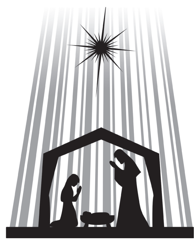
"For God so loved the world, that he gave his only Son, that whoever believes in him should not perish but have eternal life." --John 3:16