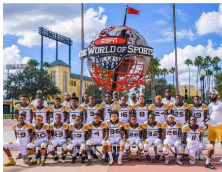
Blackhawks Athletic Club 2019 National Champs