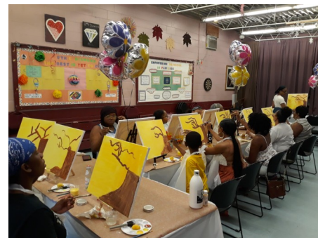
8th & Diamond Advisory Council "2019 Painting with a Purpose"