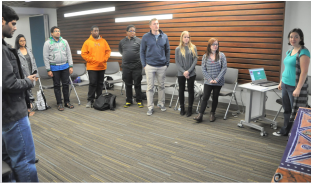
Drexel University's Campus ministry in worship.