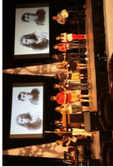
Youth reading the names of the 200 Native American children buried at Carlisle Indian School EPAUMC Annual Conference 2015