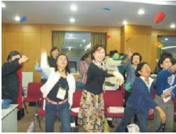
At the closing worship of the Asian Women Leadership training participants wrote prayers for mission on paper airplanes, then flew them around the room. Participants picked up each others airplanes and promised to pray the prayers.

That wasn't the expectation when 26 Korean-American United Methodist Women members went to train others at the Asian Christian Women's Leadership Training and Dialogue, October 16-21, in Incheon, Korea. These women, along with those of established organizations from Korea and