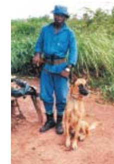
Dogs are more effective and less time consuming than metal detectors because they only detect mines, not every piece of metal. The estimated cost for training is $25,000 per dog.

$ 700.00 (UMCOR #982575) Provide care and feeding for an explosive-sniffing dog to detect landmines in Angola.