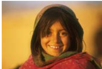
An ethnic Hazara girl, a refugee from Afghanistan, who lives in Quetta, Pakistan.

$ 100.00 (One Great Hour of Sharing) Give a gift directly to UMCOR! The OGHS offering is UMCOR's backbone and allows us to keep our promise of sending 100% of designated funds to their intended project. You can give to OGHS at anytime of the year.