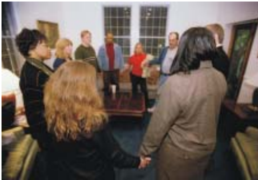
Each meeting of the Crime Victims Advocacy Council support group begins and ends with prayer.