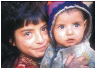
A girl in Mare Rouge. ACT is helping people in Haiti's drought-plagued northwest to survive and work for a better future.

$ 50.00 (UMCOR #982540) Help a refugee return home or find safety in a new location.