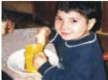
UMCOR's Christ- mas wish list. Page 7

Son of EPA elected to lead Council of Bishops Page 3