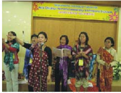
Women from the Philippines led the morning worship at the Asian Women Leadership Training.

In the eyes of the woman from Laos, the Korean-American women were Americans from the United States — a