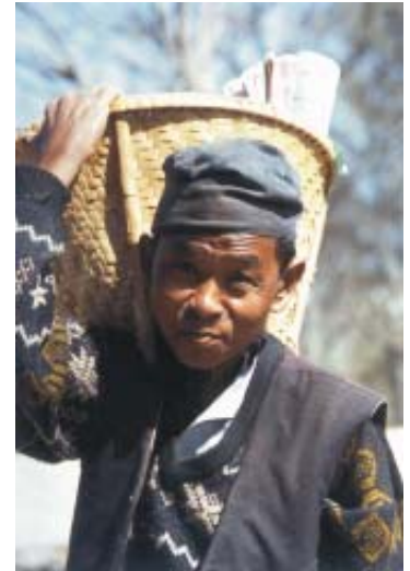
When the land is vertical and the only transportation is by foot, how does the hospital in Okhaldhunga, Nepal get its supplies? The same way everything else is transported in that part of Nepal— by human porters.

$ 200.00 (UMCOR #982450) Provide temporary shelter for a family displaced by a disaster such as an earthquake or flood.