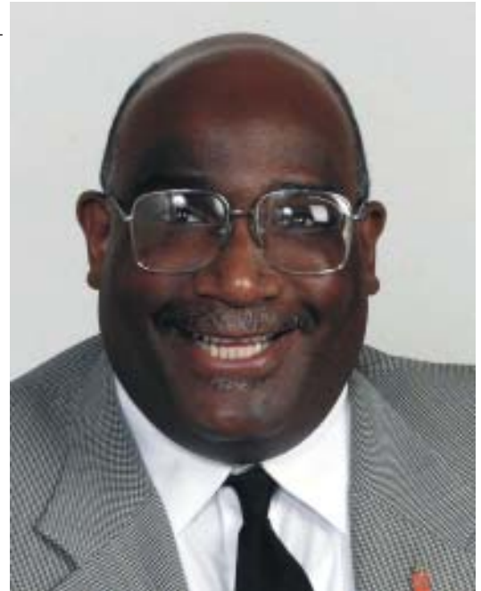
Bishop Gregory V. Palmer

The Council of Bishops is made up of all active and retired bishops of The United Methodist Church. The Council meets twice a year. According to the Book of Discipline, "The Church expects the Council of Bishops to speak to the Church and from the Church to the world and to give leadership in the quest for Christian unity and inter-religious relationships." [427.2] The council comprises 50 active bishops in the United States; 18 bishops in Eu-