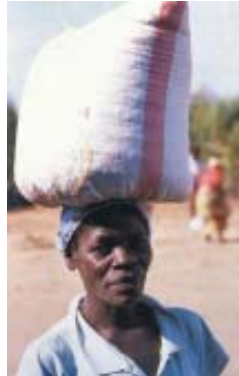
This woman is carrying a bag of corn home to her family in Lisutu, Zambia, one area in southern Africa suffering from drought. Your gifts to UMCOR's Africa Famine Relief strengthen communities and reduce the risk of recurring famine.